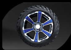
14" Color Matched Silent Tire with Offroad Thread