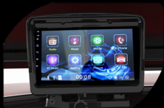
9 inch touchscreen with back-up camera