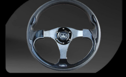
Luxury steering wheel