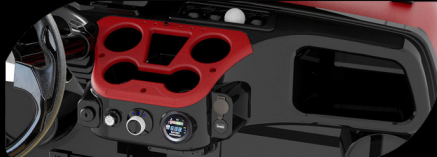
Color matched Dash with four cup holders/cell phone holder