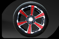
14"Aluminum Wheel with color insert/215/35R14 Radial DOT Tire