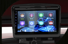
9 inch touchscreen with back-up camera