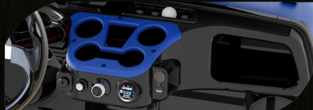
Color matched Dash with four cup holders/cell phone holder