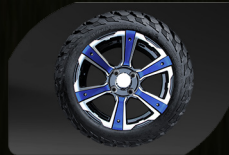
14" Color Matched Silent Tire with Offroad Thread